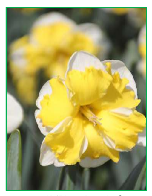
N. 'Plant America'

N. 'Plant America' – A split corona daffodil - Color Code: 11 W-Y The yellow perianth segments of this mid-season flower fold back smoothly over its white petals. It has a nice thick substance, which is why its flowers last so long. It has a strong stem and is up-facing. It grows best in full sun to a height of 12"-16", depending on the richness of the soil.