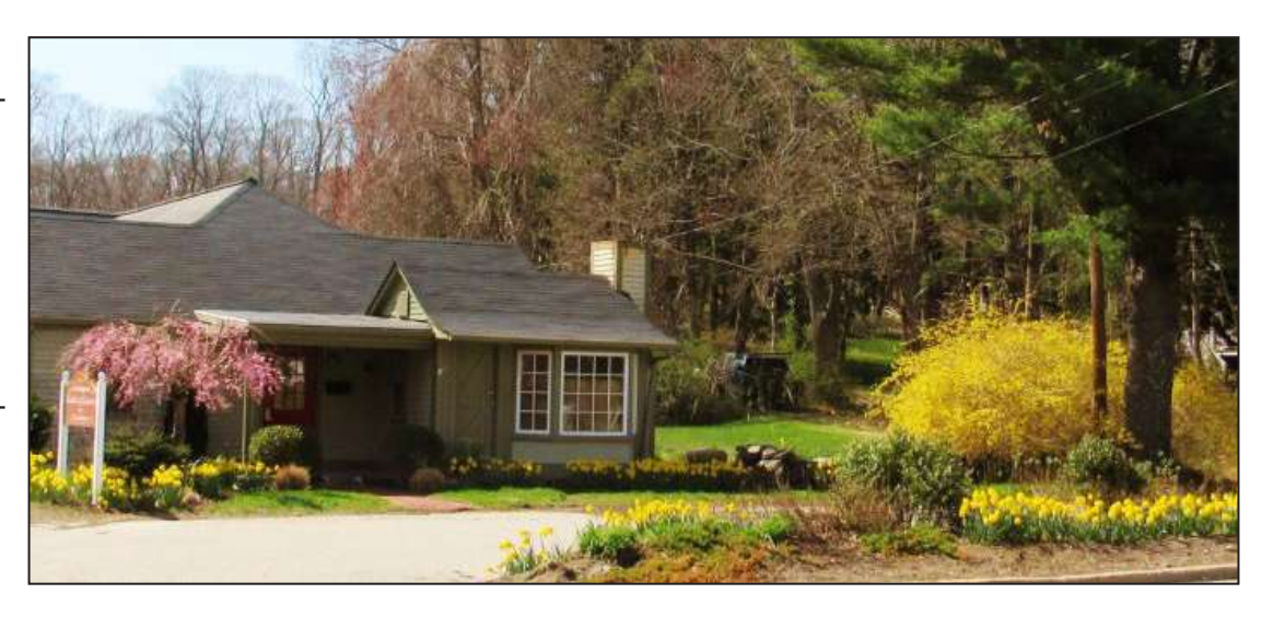
Plum Beach Garden Club in Rhode Island received a PLANT AMERICA Community Grant in 2018 to continue installation of daffodil bulbs around the town of New Kingstown.

Due to the tremendous response from individual garden clubs, it is obvious that garden clubs appreciate the opportunity to apply for funding to further their projects. It is a pleasure to read the applications and confirm what an impact garden club activities have in communities across America.