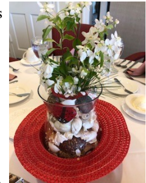
"Table centerpieces were made by our members using hats."

This fundraiser not only brought our members together but also our neighbors and friends. We will use the money